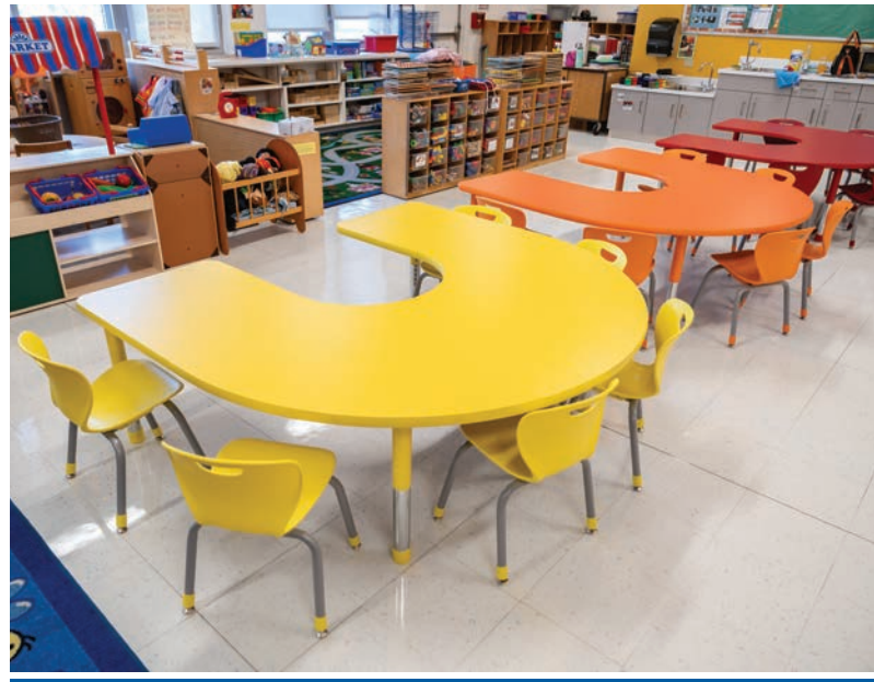
Laminate Tabletop: Primary Yellow, Clementine, and Holly Berry Edge Banding: Sunshine Yellow, Tangerine, and Primary Red