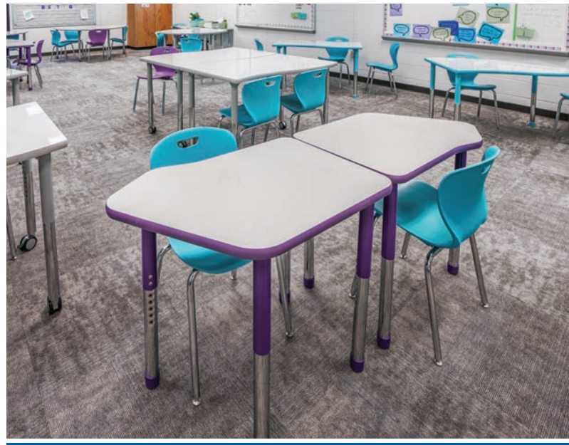
Laminate Desktop: Gray Nebula Edge Banding: Purple, Light Gray and Aqua

Colors shown in this print may vary slightly from actual product due to aging, lighting, and printing process. For accurate color representations request a complimentary physical swatch.