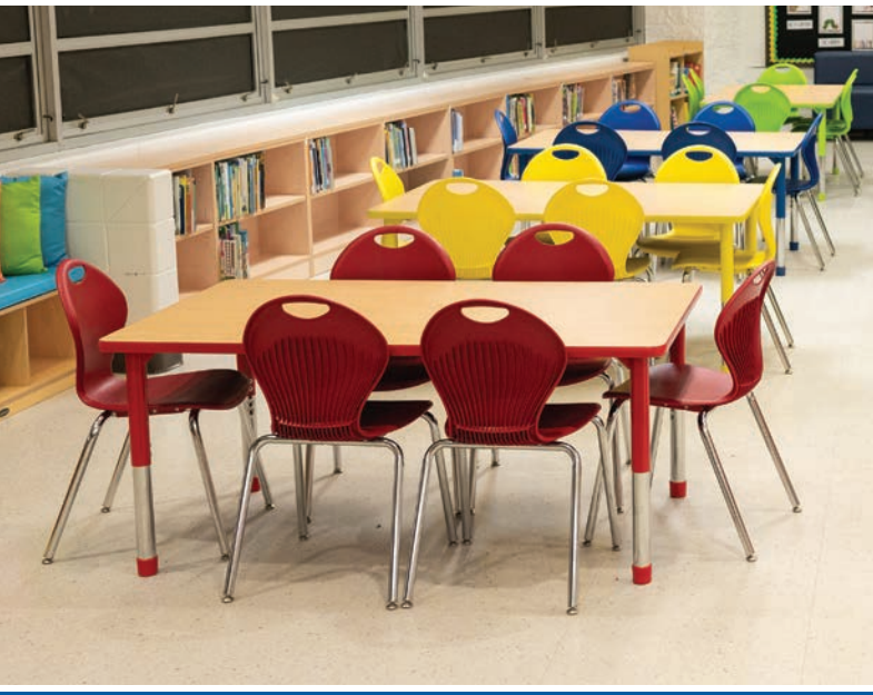
Laminate Tabletop: Fusion Maple Edge Banding: Primary Red, Sunshine Yellow, Primary Blue and Lime Green