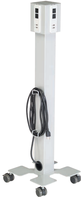
T-PWR-POST - Power Post