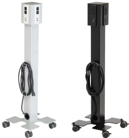
T-PWR-POST - Power Post