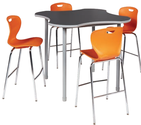
Fix. Standing Ht. WLSHF-4848CLVR - Dura Table (Shown with X-Strong Edge** & Z430 - Zed Café Stool)

Note: Casters add 2-3" to the overall height.