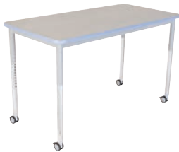
Adj. Standard Ht. WLA-2460EE - Dura Table (Shown with Optional Casters)