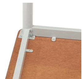
Fully Welded Strong Unitized Frame

Optional Items: Casters, Educational Edge (EE)*, Power Port, and X-Strong Edge**.