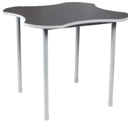
Fix. Standing Ht. WLSHF-4848CLVR - Dura Table (Shown with X-Strong Edge**)