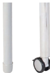
Fix. & Adj. Option