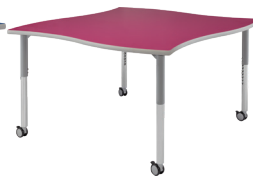
Standard Ht. HS-5252ML - Melody