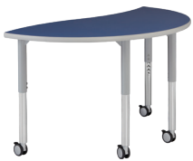
Standard Ht. HS-3052RY - Rhythm