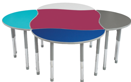
HS-5252ML & HS-3052RY - Melody and Rhythm Configuration

Need help configuring in groups? Request a complimentary puzzle set.