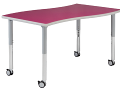
Standard Ht. HS-3152CD - Chord