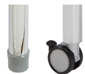
Adjustable Legs Compatible with Casters or Glides