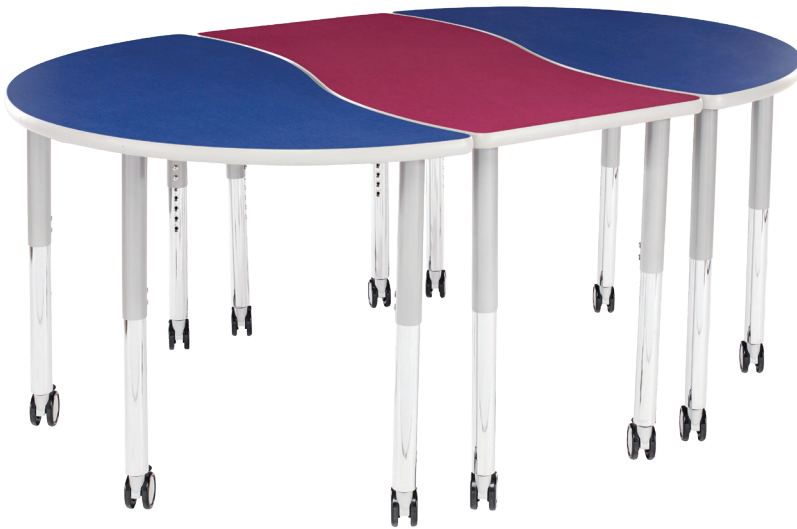
HS-3152CD & HS-3052RY - Chord and Rhythm Configuration (Shown in Formica Amarena #6907 and Spectrum Blue #851 with optional Casters)