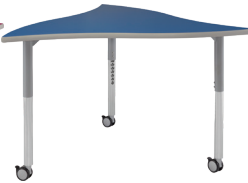
Standard Ht. HS-5252TN - Tone