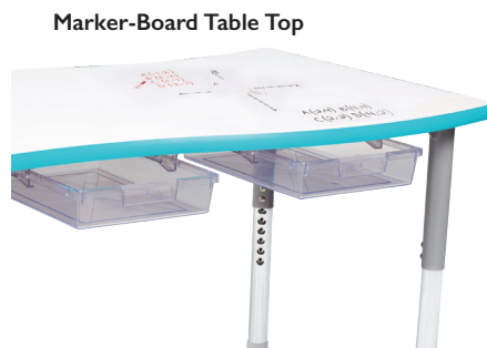
Marker-Board Table Top