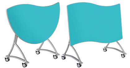
Nesting Table V2N-3152-CD - Chord & V2N-3052-RY - Rhythm