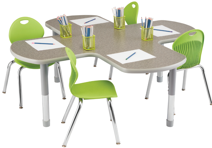
HLEE-6060PL - Inspiration Table

(Shown in custom laminate Formica Charcoal Boomerang #6942 with Lime Green Inspiration Chairs)