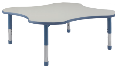
Toddler Ht. HLEES-4848CLV - Clover Table