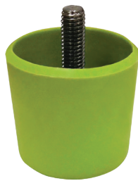
Height Adjustable Glide