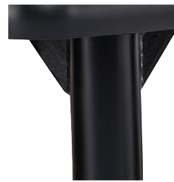
Heavy Duty Support Plate