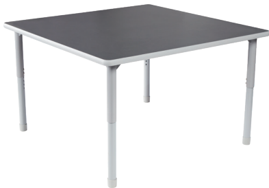
Standard Ht. HL-4848SQ - Square Table