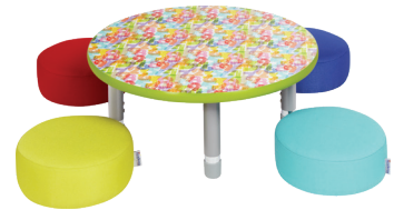
Sushi Ht. HLEESUS-36R - Round Table (Shown with 8104 - (4) Pebble Mod®)