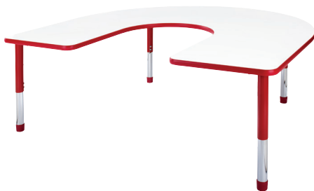
Height Adjustable Leg