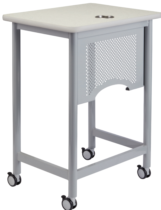
Standing Fix. Ht. TVSHF-2430 - Vantage Teacher Desk (Shown with optional Casters and Cup Holder)