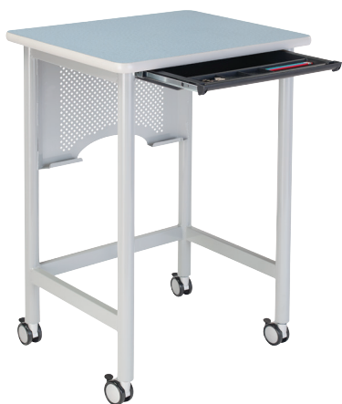
Fix. Standard Ht. TVF-2430 - Vantage Teacher Desk (Shown with optional Casters & Pencil Drawer)