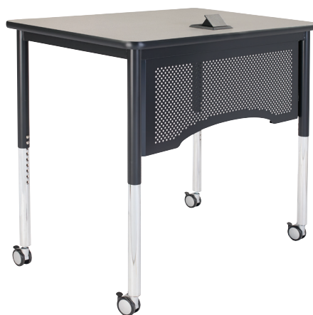
Adj. Standing Ht. TVSHA-3048 - Vantage Teacher Desk (Shown with optional Power Supply & Casters)