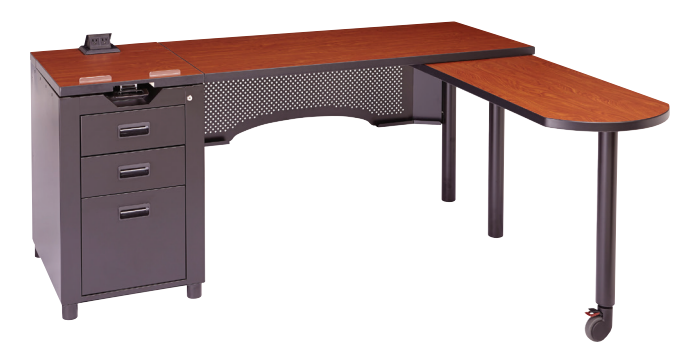
TSP-2468 - Teacher Station w/ Stationary Podium