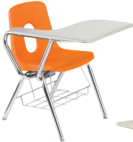
3218HP - 18" Classic Tablet-Arm Combo Desk