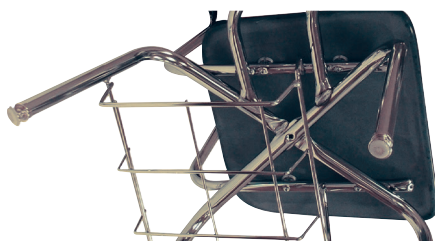
Underseat Steel Structure

*Bookbasket on combo is standard, but can be requested without one at the time of ordering. Bookbasket must be installed by manufacturer.