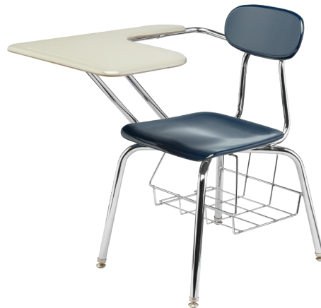
3518HP - 18" Right Handed Hard Plastic Tablet-Arm Combo Desk