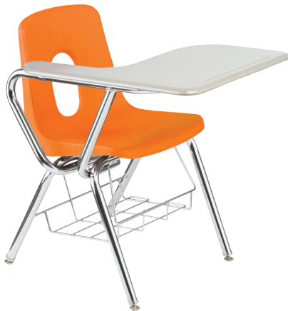
3218HP - 18" Classic Tablet-Arm Combo Desk