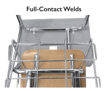
Under Desktop Construction