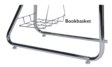
Optional Sled Base Glide

*Bookbasket on combo is standard, but can be requested without one at the time of ordering. Bookbasket must be installed by manufacturer.