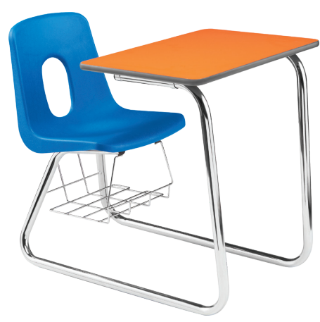
2618 - Sled Base Combo Desk