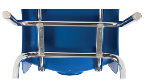
14-Gauge Underseat Steel

*Bookbasket on combo is standard, but can be requested without one at the time of ordering. Bookbasket must be installed by manufacturer.