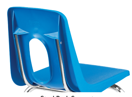
Steel Back Supports