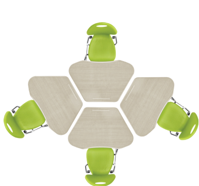
Pod of Four