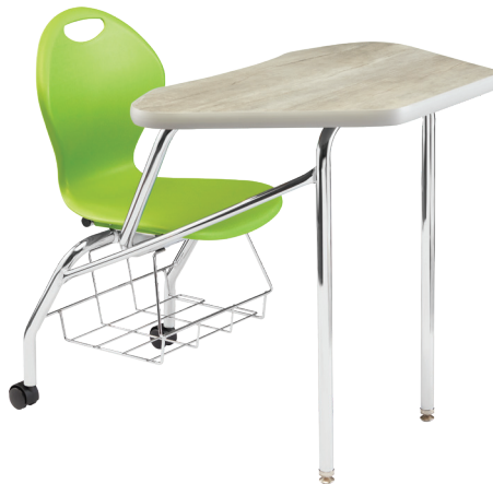
2958C - 18" Unity Study Combo Desk w/ Back Casters