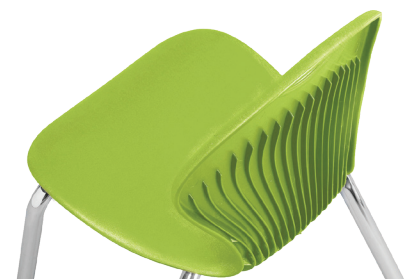
Back with Ribs

Optional Items: Glide Caps (Felt, Rubber and Steel), and Hard & Soft Casters.