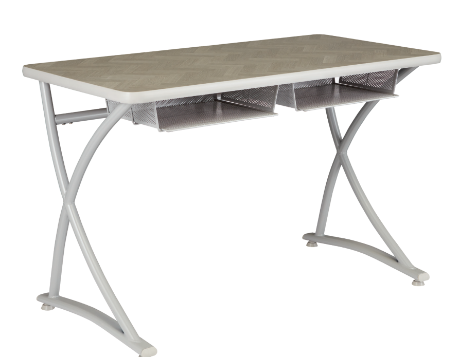
2759 - Fix. Ht Illustration V2 Double Desk

(Shown in custom laminate Formica Silver Oak Herringbone #9311)