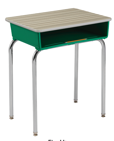
Fix. Ht. 1150EE2 - Standard Desk