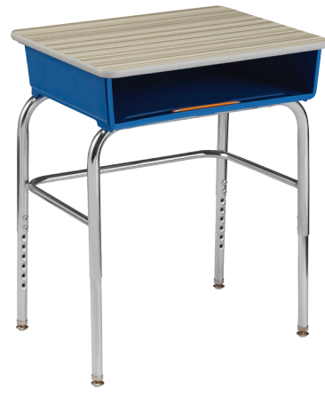
Adj. Ht. 1100UEE2 - Standard Desk with U-Brace