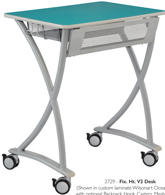
2729 - Fix. Ht. V2 Desk (Shown in custom laminate Wilsonart Ocean #D502 with optional Backpack Hook, Casters, Mesh Bookbox & Modesty Panel)