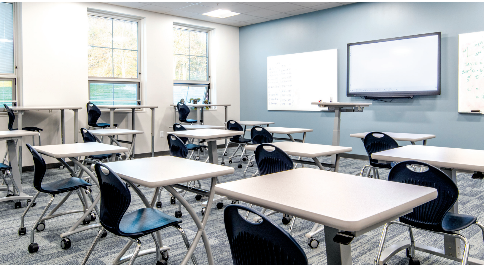
Illustration V2 Series – School Desk

The wide frame design gives students extra leg room and the legs are height-adjustable for use in any grade.