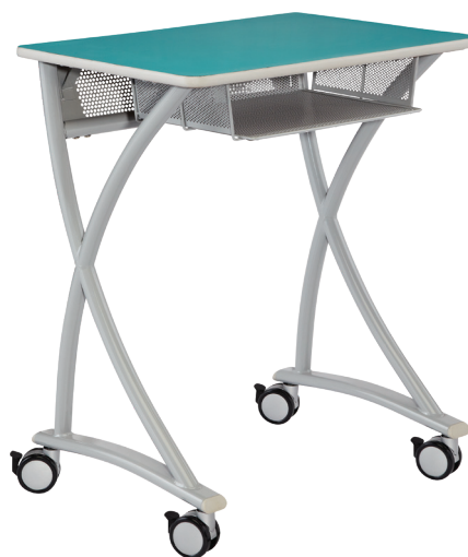
2729 - Fix. Ht. V2 Desk (Shown with optional Backpack Hook, Casters, Mesh Bookbox & Modesty Panel)