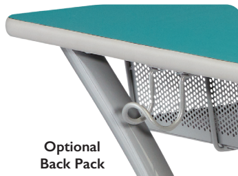
Optional Back Pack Hook