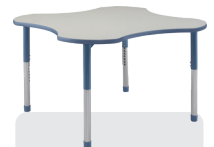
Hercules Tables See page 96-97