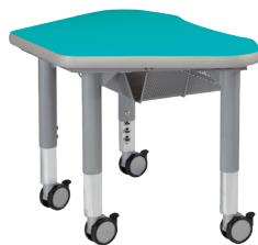
Toddler Ht. 1900S - Petal Desk