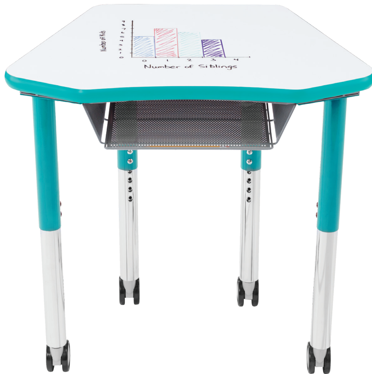
I950EE - Junior Petal Desk (Shown with optional Casters and Mesh Bookbox)