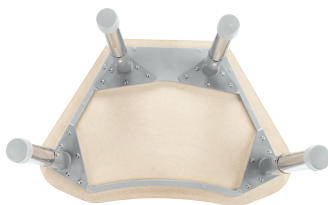
Fully Unitized Frame