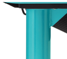
Heavy-duty support plate

Optional Items: Backpack hook, Casters, Educational Edge (EE)*, Mesh Bookbox.