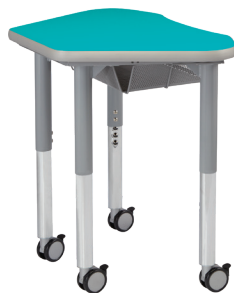
Standard Ht. 1900 - Petal Desk