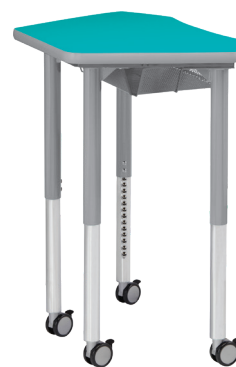
Standing Ht. 1900SH - Petal Desk