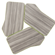
Pod of 3

*Educational Edge (EE) for Desks is a color coordinated edge banding and legs. Note the color needed when ordering.