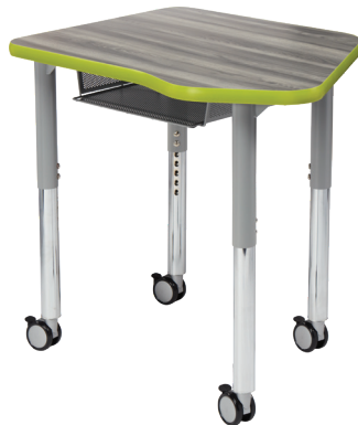
5300 - Right Handed Junction Desk