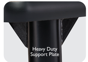
Heavy Duty Support Plate

Optional Items: Educational Edge (EE)*, Hard and Soft Casters, Mesh Bookbox, Backpack Hook.