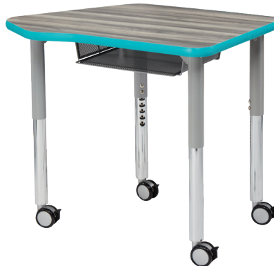
5300LH - Left Handed Junction Desk