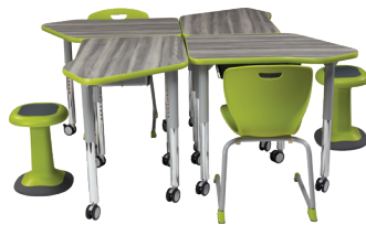
5300 - Pod of 3 & 4 Desks

(Shown with optional Casters & Mesh Bookbox)