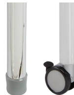
Adjustable Legs Compatible with Casters or Glides

(Shown with optional Casters & Mesh Bookbox)