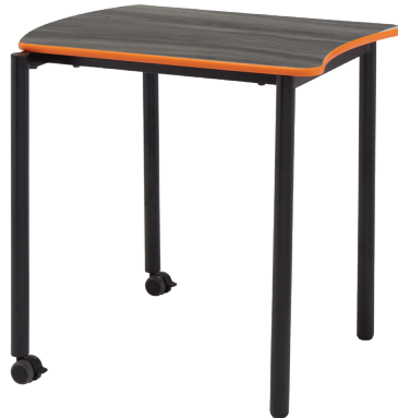
Fix. Ht. 4429 - S4 Student Desk