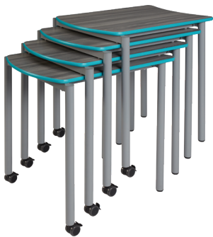
4429 - S4 Student Desk Stacked