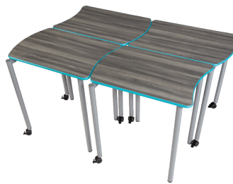
4429 - Concave & Convex Sides