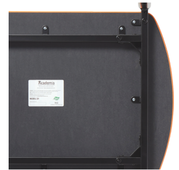
Fully Unitized Frame