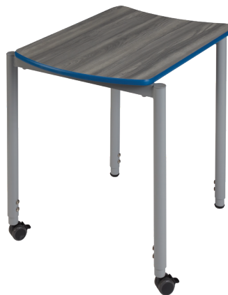
Adj. Ht. 4400A - S4 Student Desk