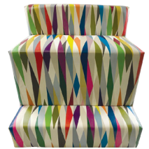
8828 - 3 Step Mod®