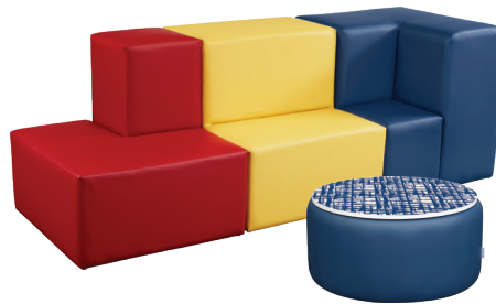
8848 - Outside Corner Mod®, 8818 - 2 Step Mod®, 8838 - Inverted Corner Mod® & 8138-LAM - 30" Round Mod® with Laminate Top