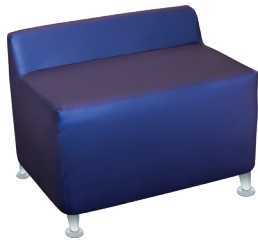
8628 - 1/4 Back Mod®