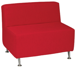
8648 - 3/4 Back Mod®