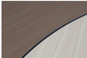
New Silver Riftwood and Buff Elm Laminate