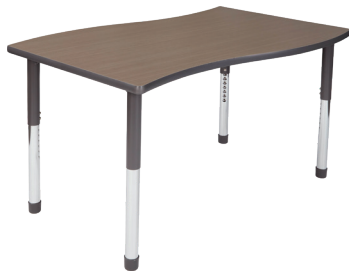
Standard Ht. HS-3152CD - Chord