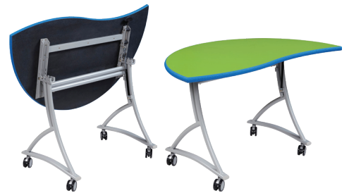
V2N-3052-RY - Harmony Nesting Rhythm Table