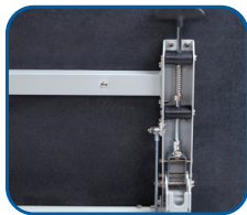
Nesting Table Hidden Handlebar