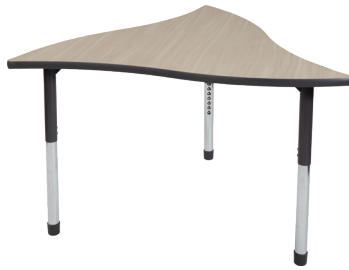
Standard Ht. HS-5252TN - Tone