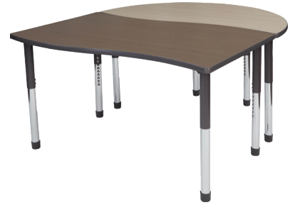
HS-3152CD & HS-3052RY - Chord and Rhythm Configuration