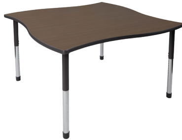
Standard Ht. HS-5252ML - Melody