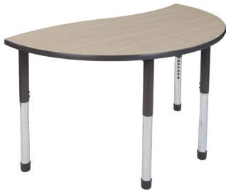
Standard Ht. HS-3052RY - Rhythm