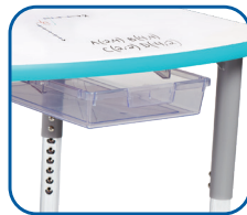
Clear or Crystal Tray 9CRTWD-SLIMTRAY-C