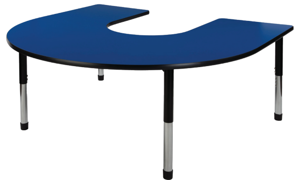
Standard Ht. HL-6066HS - Horseshoe Table (Shown in Spectrum Blue laminate)