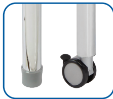
Adj. Legs Compatible with Casters or Ht. Adj. Glides