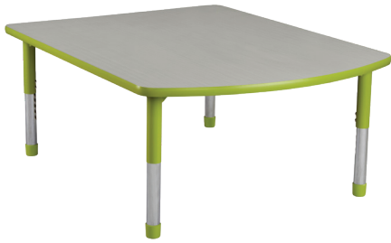
Toddler Ht. HL-4254CU - Curved Table (Shown in Sky Rise laminate)