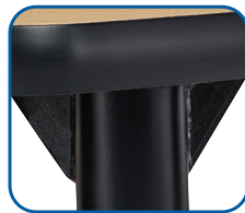
Heavy Duty Support Plate