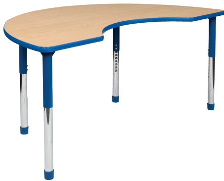
Standard Ht. HL-3672-KI - Kidney Table (Shown in Fusion Maple laminate)