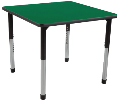
Standard Ht. HL-3636SQ - Square Table (Shown in Spectrum Green laminate)