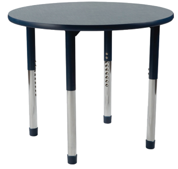
Standard Ht. HL-36RD - Round Table (Shown in Chambray Fabric laminate)