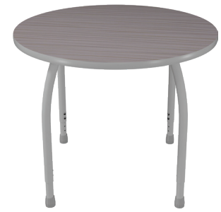
FL-36RD - Round Table