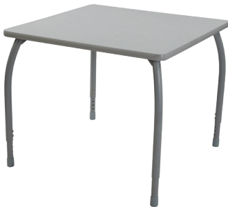
FL-3636SQ - Square Table (Shown in custom laminate)