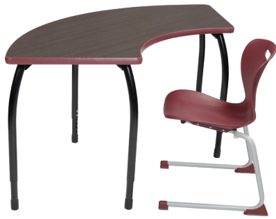
FL-2460CN - Corner Table (Shown in Black Riftwood laminate with Zed Cantilever Chair)