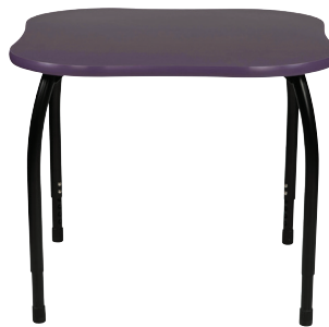
FL-4242SC - Squircle Table (Shown in Cassis laminate)