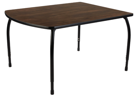
FL-4254CU - Curved Table (Shown in Antique Mango laminate)