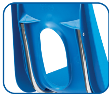
Steel Back Supports and Vented Back