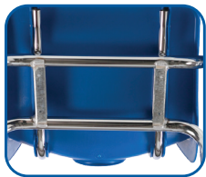
14-Gauge Underseat Steel