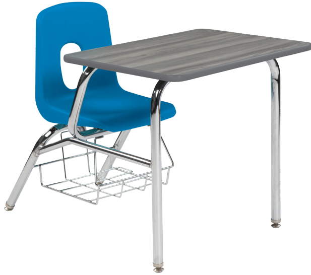
2214 - 14" Classic Combo Desk*