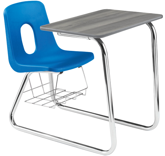
2618 - Sled Base Combo Desk*