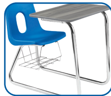
Sled Base entry from either side