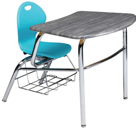
2914WS - 14" Inspiration Combo Desk