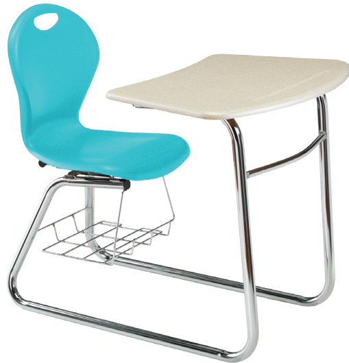
2918WSSB - Sled Base Combo Desk