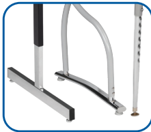
Adj. Frame Options T-Leg, Illustration V2 or Activity-Leg