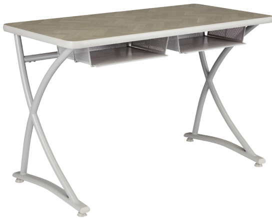
2759 - Fix. Ht Illustration V2 Double Desk