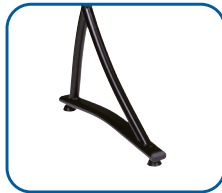
Fix. Frame Option Illustration V2