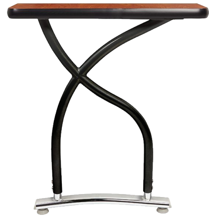
2750 - Adj. Ht Illustration V2 Double Desk