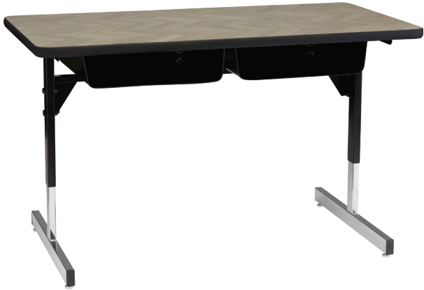
1550 - T-Leg Double Desk