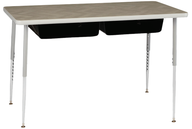
1650 - Activity-Leg Double Desk