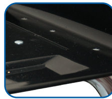
Riveted Bookbox Comes in Black Only