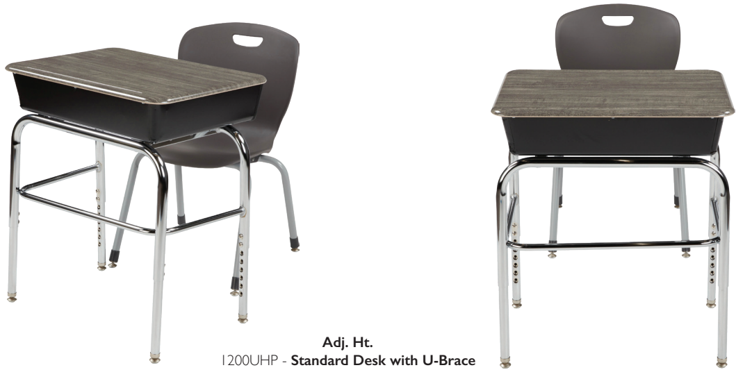
Adj. Ht. 1200UHP - Standard Desk with U-Brace (Shown in Driftwood Hard Plastic Top)