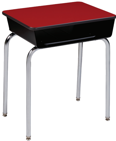
Fix. Ht. 1250 - Standard Desk