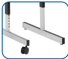
Adj. Legs Compatible with Casters or Micro-Adj. Glides