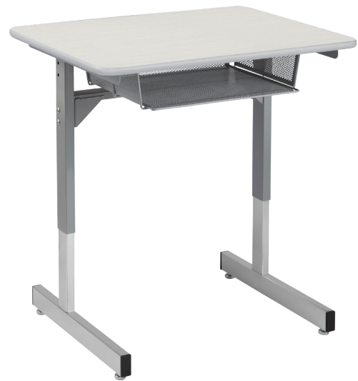
(Shown in Sky Rise laminate)