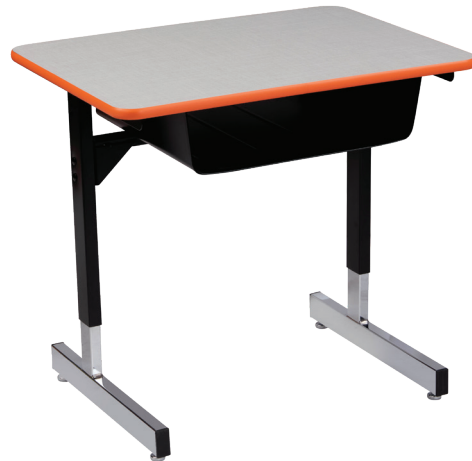
1500WBB - T-Leg Desk with Bookbox (Shown in Gray Fabric laminate and Tangerine T-Mold)