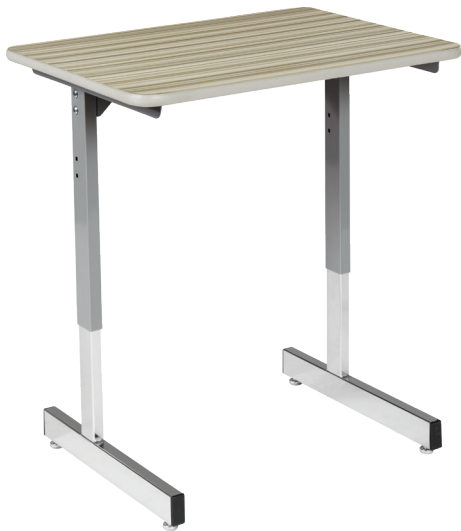
1500 - T-Leg Desk