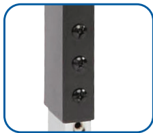
T-Leg with Three Screws