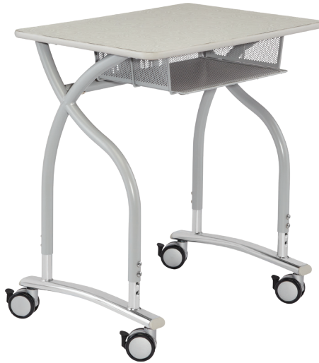
2700 - Adj. Ht. V2 Desk (Shown with optional Casters and Mesh Bookbox)