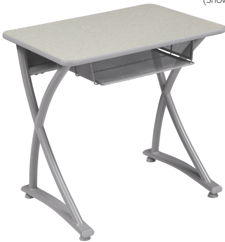
2726WBB - Fix Ht V2 Desk (Shown with optional Mesh Bookbox)