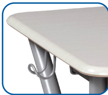
Optional Backpack Hook