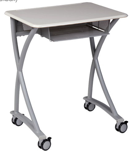
2726HPWBB - Fix Ht V2 Desk (Shown with optional Casters and Mesh Bookbox)