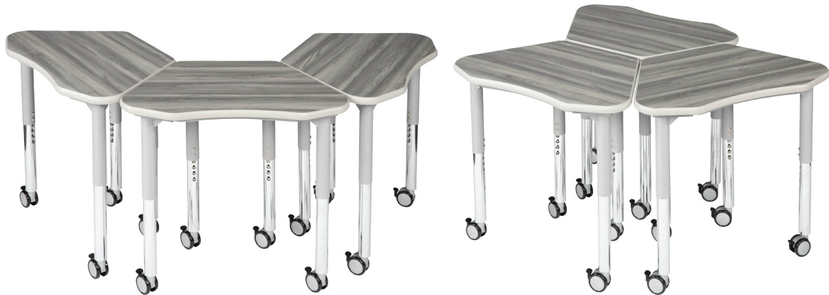
Petal Desk Pods