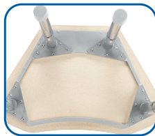
Fully Unitized Frame