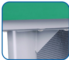
Heavy-duty Support Plate