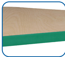
Optional PVC 3mm Edge (Primary Green)