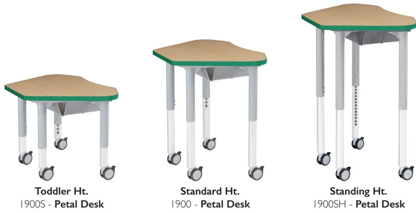
Toddler Ht. 1900S - Petal Desk