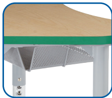
Optional Mesh Bookbasket