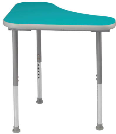
Standard Ht. 2000 - Innovation Desk