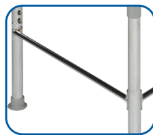
Standing Height Brace