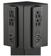
Power Post See pages 138-139