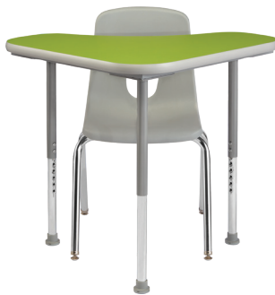
Forward Facing Position