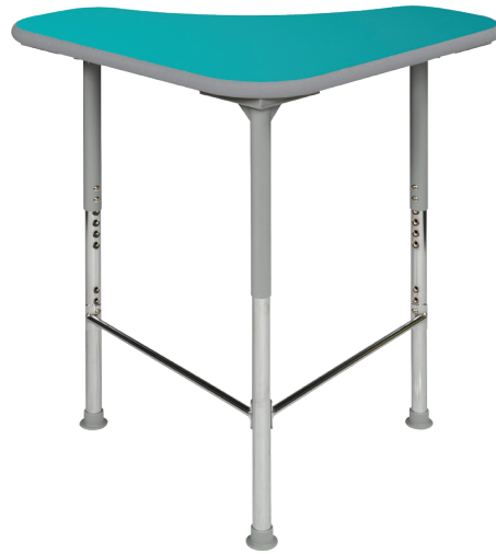
Standing Ht. 2000SH - Innovation Desk