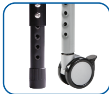
Adj. Legs Compatible with Casters or Ht. Adj. Glides