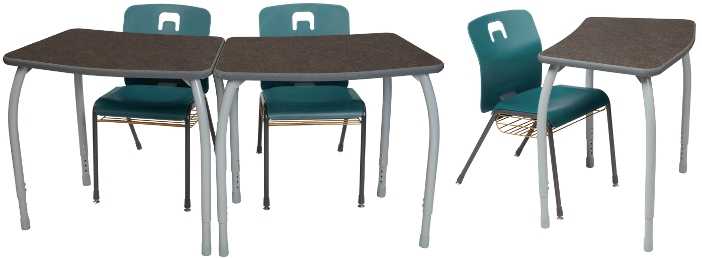
5400 - Synco Desk (Shown with Aura Chair)