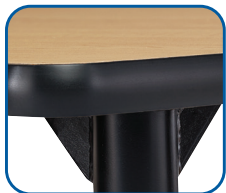
Heavy Duty Support Plate