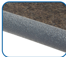
Optional X-Strong Edge (Graphite)