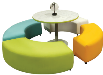
8718 - Arc 4 Mod® with CF-30R - Café Table