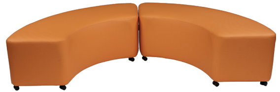
8718 - Arc 4 Mod®

"The Mod Series" & "Mod" are registered trademarks of Academia Furniture Industries.