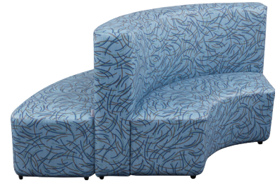
Create a 2nd side on a "couch" (8717 & 8708 - Arc 4 Mod® Combo)