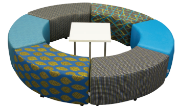
8728 - Arc 6 Mod® with 8020SQ - Mod® Table