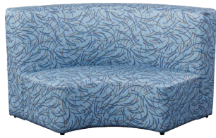
8717 - Arc 4 Mod® with Backrest