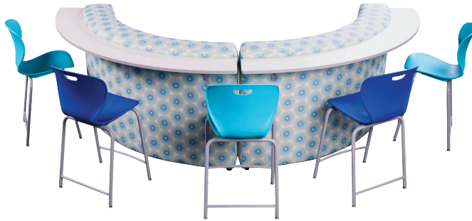
8717-SHELF - Arc 4 Mod® with Backrest & Shelf