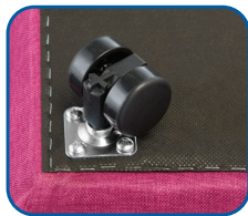
Optional Twin Casters