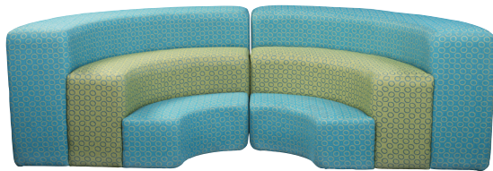
8888 - Rainbow Mod®