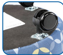
Optional Compression Casters