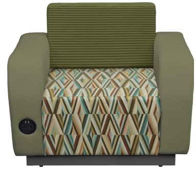
REB24-ARM - Bench with Back & Arm Rest