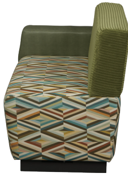
REB36-ARM-RH - Bench with Back & One Right Arm