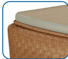
Laminate Inside Corner w/ Signature Welt Piping