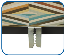
Underside Base w/ Standard Ganging