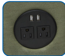
Flush Power Port