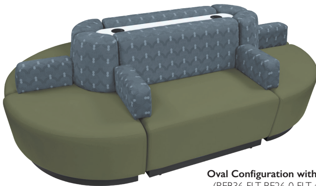
Oval Configuration with Floating Arms (REB36-FLT, RE26-0-FLT and RE36-SHF)