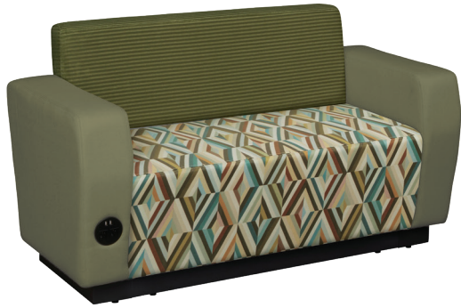
REB42-ARM - Bench with Back & Arm Rest