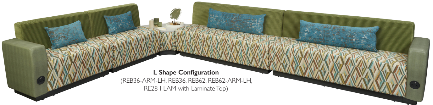
L Shape Configuration (REB36-ARM-LH, REB36, REB62, REB62-ARM-LH, RE28-I-LAM with Laminate Top)