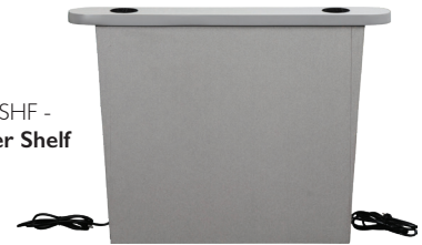
RE-SHF - Power Shelf