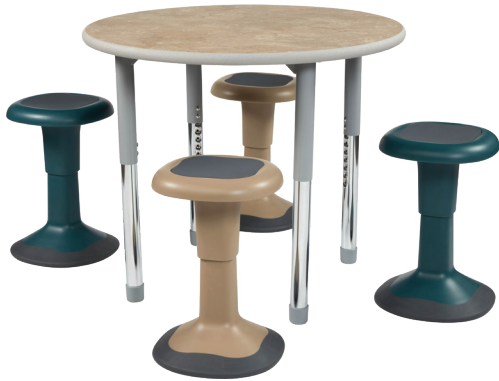
SQ-18 & HL-36RD Active Seating Stool & Hercules Round Table