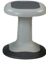
SQ-15 - 15"