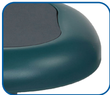
Waterfall Edge Seat