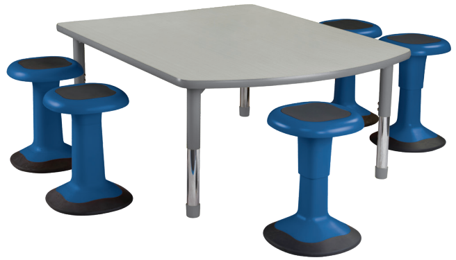
SQ-18, SQA & HLS-4254CU Active Seating Stool & Hercules Curved Toddler Ht. Table