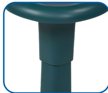
Adj. Ht Option