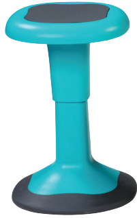
SQA - 15½" - 19½"