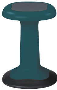
SQ-18 - 18"