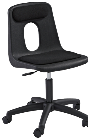
158P - Computer Chair with Pads