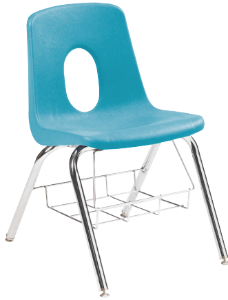
128WBB - Chair with Bookbasket