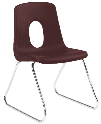
128SB - Sled-Base Chair