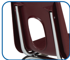
Steel Back Supports