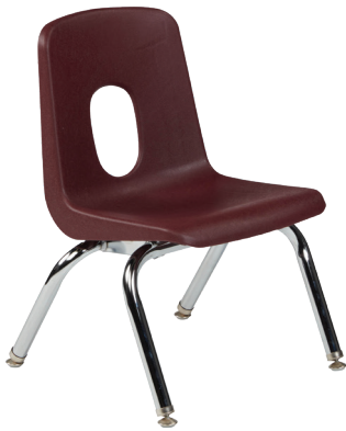
122 - Chair