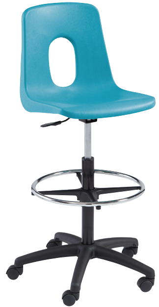
158D - Drafting Stool