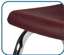
Waterfall Edge Front