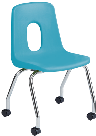
128C - Chair with Casters