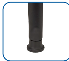
Optional Drafting & Computer Chair Stationary Glides