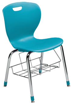
Z18WBB - Standard Chair with Boots & Bookbasket** Chrome Frame