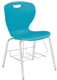
Z28WBB - Value Chair with Bookbasket** Chrome Frame