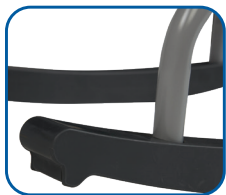
Rocker Chair Anti-Tip Safety Rubber Glides