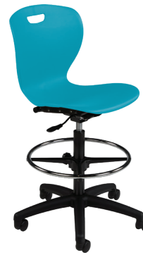
Z58D - 24-33" Drafting Stool