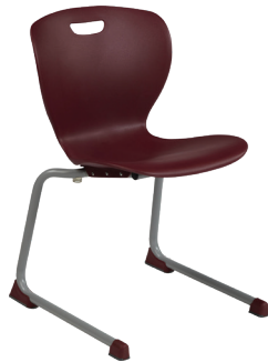
Z68B - Cantilever Chair Gray Powder Coated Frame*