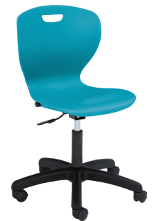
Z58 - 17-23" Computer Chair

*Standard, Value, Cantilever Chair, Rocker Chair and Café Stool Available in Gray (G) Powder Coating or Black (B) Powder Coating