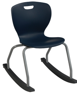
Z28RG - Zed Rocker Chair Gray Powder Coated Frame*