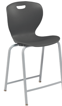
Z424G & Z430G - Zed Café Stool Gray Powder Coated Frame*