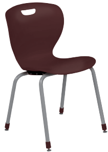
Z14G - Standard Chair with Boots Gray Powder Coated Frame*