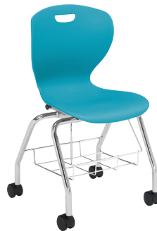
Z28CWBB - Value Chair with Casters and Bookbasket** Chrome Frame