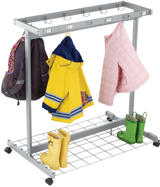
4670 - Mobile Knapsack Rack (Accessories shown not included)