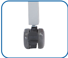
Mobile Easel Locking Casters