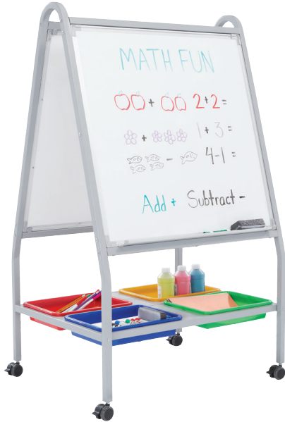
7700 - Mobile Easel (Accessories shown not included)