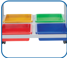
Mobile Easel Storage Compartments