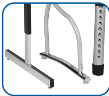
Adj. Frame Options T-Leg, Illustration V2 or Dura Leg