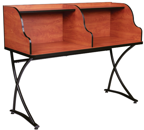
Fix. Ht. Illustration V2 Frame SCV2F-2460 - Double Study Carrel Shown in Wild Cherry

*Shown in custom laminate Formica Ashen Ribbonwood 8839 & marker board laminate for work surface