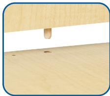
Easy Assembly with Dowels