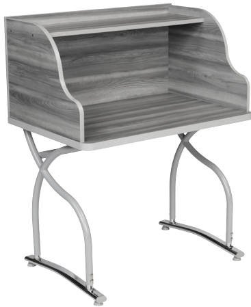
Adj. Ht Illustration V2 Frame SCV2A-2436 - Single Study Carrel