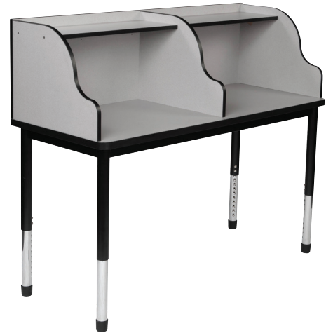
Adj. Ht Dura Leg Frame SCWLA-3660 - Double Study Carrel