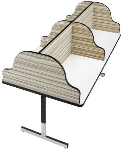
Adj. Ht T-Leg Frame SCTL-3660 - Quad Study Carrel*