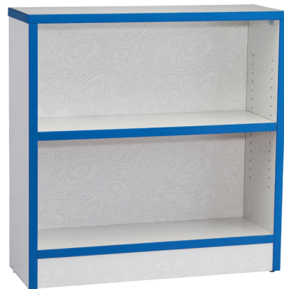
BC-3636 - Single-Sided Bookcase