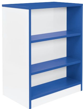
BCD-3648 - Double-Sided Bookcase