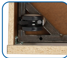
Heavy Duty Casters (Double Mobile Bookcases Only)