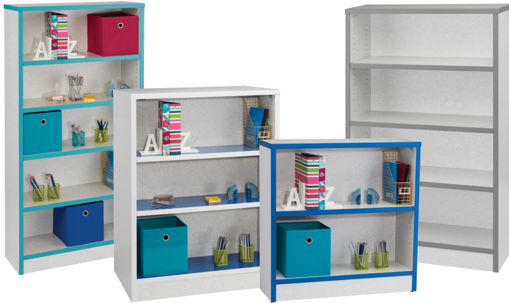
Stax Bookcases (Various single and double-sided sizes available)