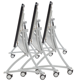
V2N Nesting Table Group w/ Modesty Panel