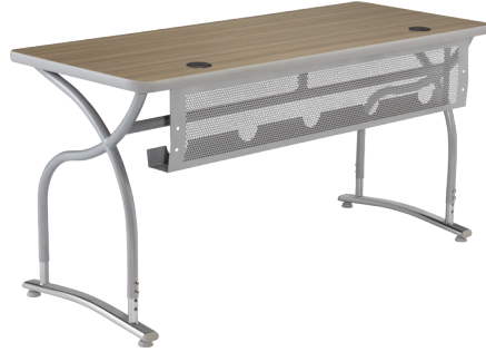
Adj. Ht. V2CO-2460 - Illustration V2 Computer Table