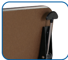
Nesting Table One Hand Lever Mechanism