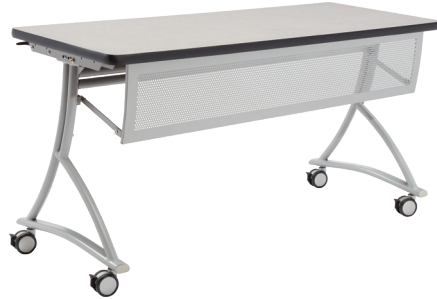
Fix. Ht. V2NMP-3060 - V2N Nesting Table with Modesty Panel