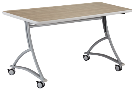
Fix. Ht. V2N-3060 - V2N Nesting Table