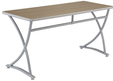
Fix. Ht. V2F-2460 - Illustration V2 Seminar Table