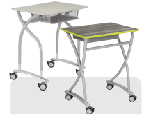
Illustration V2 Desk See page 64-65