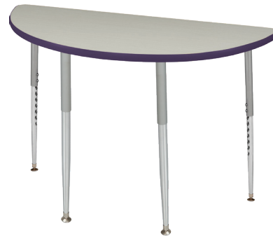
Standard Ht. AL-48HR - Half Round Activity Table