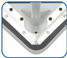
Underside Mounting Plate