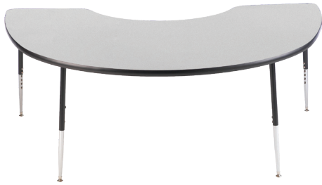
Standard Ht. AL-3672KI - Kidney Activity Table