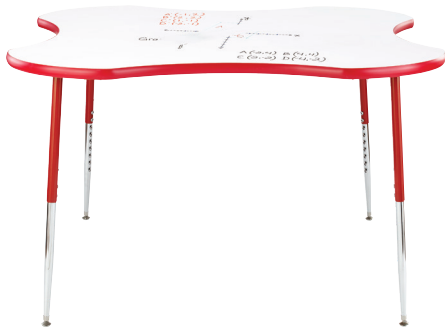
Standard Ht. AL-4848CV - Clover Activity Table