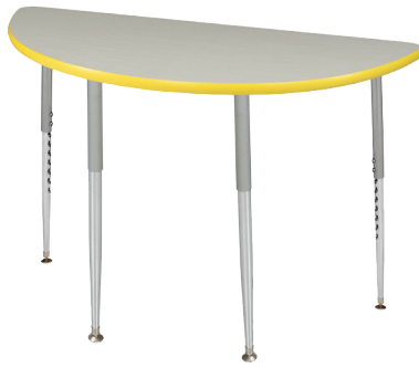
Standard Ht. AL-48HR - Half Round Activity Table