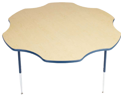
Standard Ht. ALEE-6060FL - Flower Activity Table