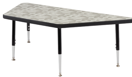
Toddler Ht. ALS-2448TR - Trapezoid Activity Table (Shown in custom laminate Formica Gray Joseph Linen #6325)