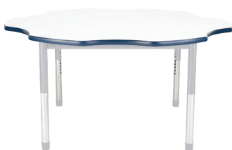
Adj. Standard Ht. WLA-6060FLEE - Flower Dura Table