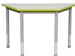
Adj. Standard Ht. WLA-2448TR - Trapezoid Dura Table