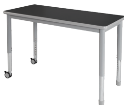
Adj. Standard Ht. WLA-2460 - Rectangle Dura Table (Shown with Wheelbarrow Option)