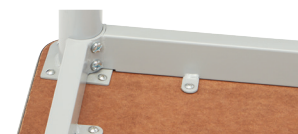
Fully Welded Strong Unitized Frame