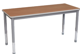
Adj. Standard Ht. WLA-2460 - Rectangle Dura Table