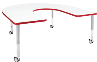
Adj. Standard Ht. WLA-6066HS - Horseshoe Dura Table (Shown with Optional Casters)