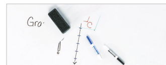
Marker-Board Table Top Option