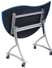
V2N-3052-RY - Harmony Nesting Rhythm Table (Shown in New Standard Laminate Vibrant Green and Primary Blue X-Strong Edge)