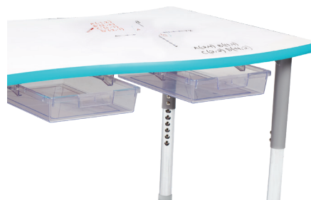
9CRTWD-SLIM TRAY-C Clear or Crystal Tray