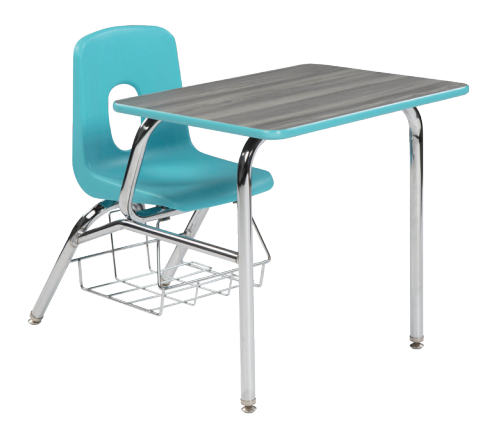
2214 - I4 " Classic Combo Desk (Shown with Driftwood top and custom Aqua edge banding)