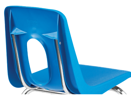
Steel Back Supports