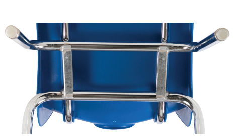
14-Gauge Underseat Steel

Optional Items: Glide Caps (Felt, Rubber and Steel) and Rubber screw-in glides for Sled Base combo.