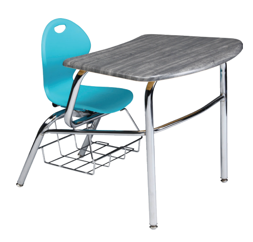
2914WS - 14" Inspiration Combo Desk