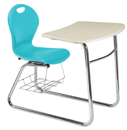
2918WSSB - Sled Base Combo Desk