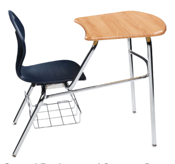
Curved Desktop and Support Brace