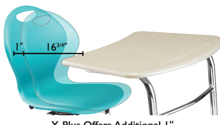
X-Plus Offers Additional I" Clearance from Seat to Desktop