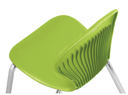
Back with Ribs