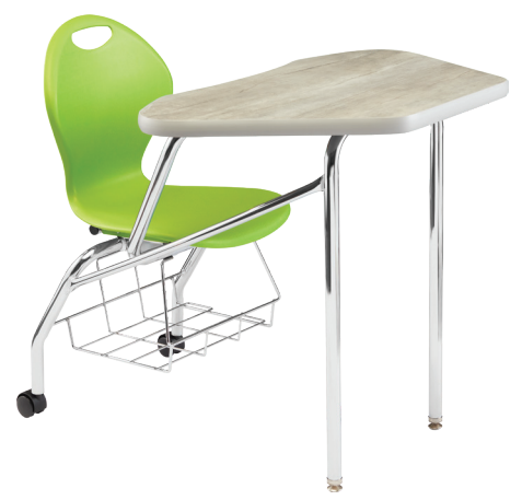
2958C - 18" Unity Study Combo Desk w/ Back Casters