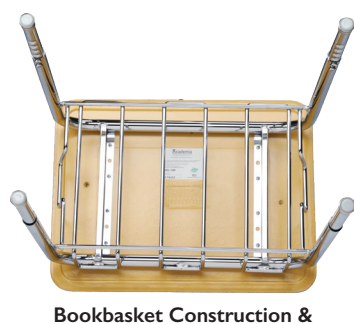
Underside of Desk

Optional Items: Glide Caps (Felt, Rubber and Steel).