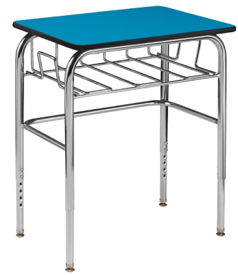
1300U - Open View Standard Desk with Bookbasket & U-Brace