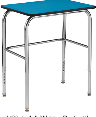
1400U - Adj. Writing Desk with U-Brace