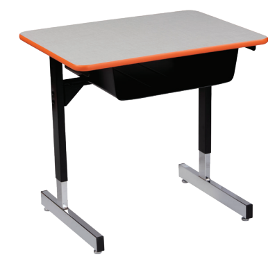
1500WBB - T-Leg Desk with Bookbox (Shown in New Standard Laminate Gray Fabric and Tangerine T-Mold)