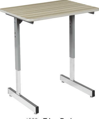
1500 - T-Leg Desk