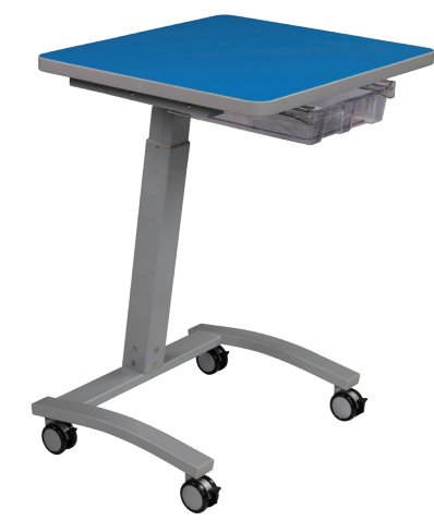
1626 - Surge Desk (Shown in custom Matrix Blue Top and Grey Pvc 3mm Edge)