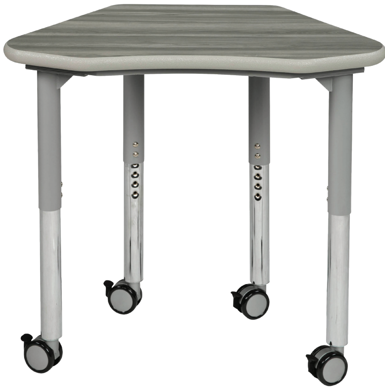
1900 - Petal Desk (Shown in Driftwood Laminate with Optional Casters and X-Strong Gray Edge)