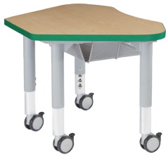
Toddler Ht. 1900S - Petal Desk