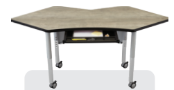
Lazer Teacher Desk See page 118-119