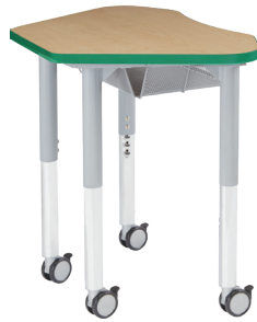
Standard Ht. 1900 - Petal Desk