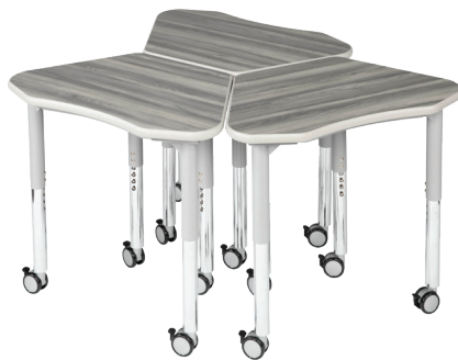
Petal Desk Pods