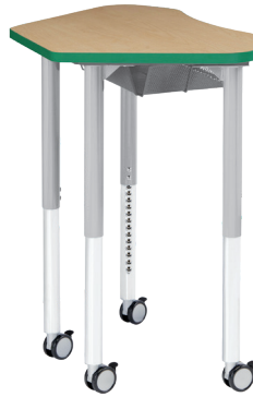
Standing Ht. 1900SH - Petal Desk