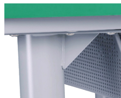
Heavy-duty support plate